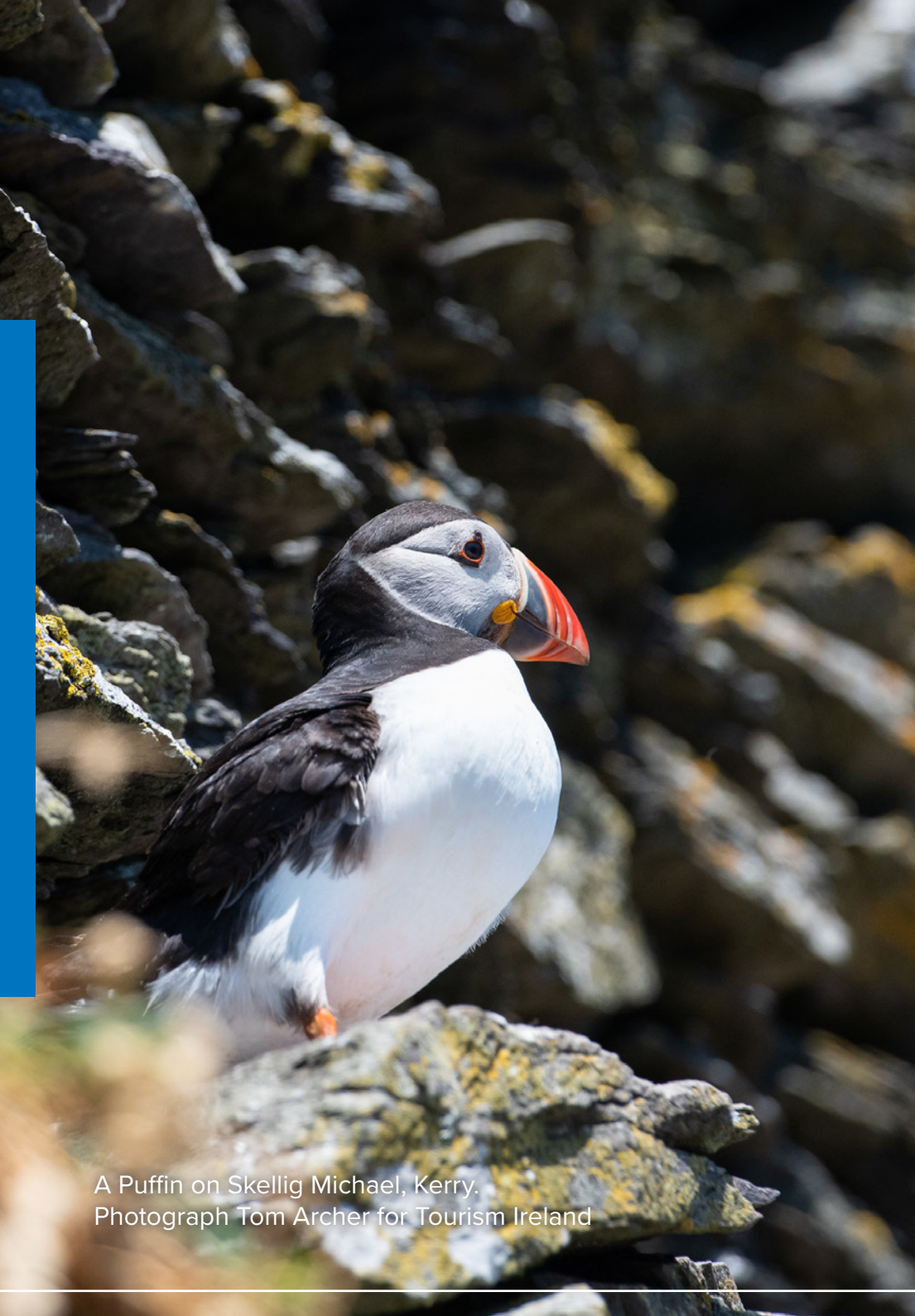
A Puffin on Skellig Michael, Kerry.